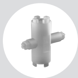
1 Universal Key