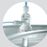
3 Dispensing head