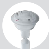
2 Dip tube S62x5