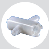
1 Universal Key