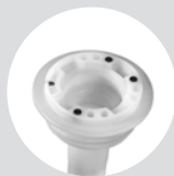
2 Dip tube S62x5