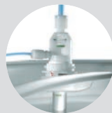
3 Dispensing head